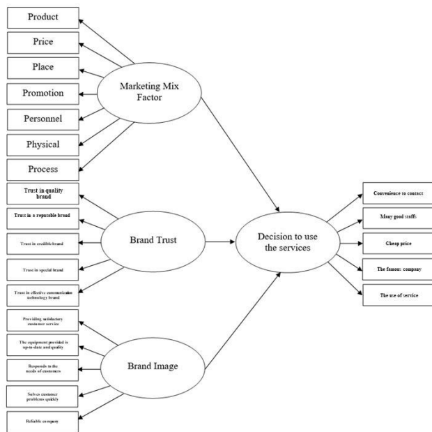
Figure 1: Conceptual framework