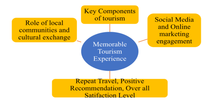
Figure 1 Conceptual Model Developed by Authors