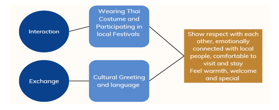
Figure 4 The result of local communication and cultural exchange interaction which support to be MTEs

Engaging with local customs and communities significantly enhances the travel experience in Thailand. Participating in traditions, such as wearing Thai costumes and learning basic phrases, fosters meaningful interactions and demonstrates respect for the culture. The warm hospitality of locals creates a welcoming environment, while local guides provide insights into lesser-known attractions and cultural heritage. These practices not only deepen travellers' appreciation for Thai culture but also lead to more fulfilling and memorable experiences, emphasising the importance of cultural engagement in tourism.